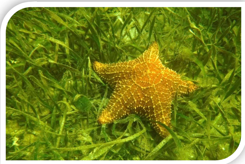
A cushion sea star in turtle grass, photographed by DERM biologists in northern Miami-Dade County.

chlorophyll concentrations across the bay relative to baseline conditions remain an issue. Total phosphorus conditions are generally “fair” or “poor” throughout northern Biscayne Bay and most tidal portions of tributaries across the watershed. Total nitrogen and chlorophyll-a remain largely “fair” or “poor” across Biscayne Bay and its tributaries, with South North Bay-A remaining in “poor” condition for several years, along with most coastal regions. This was the first year that all regions but for South North Bay – C are in “poor” condition for elevated chlorophyll levels. This aligns with the state’s recent designation of several regions in Biscayne Bay impaired for chlorophyll-a and/or total nitrogen.