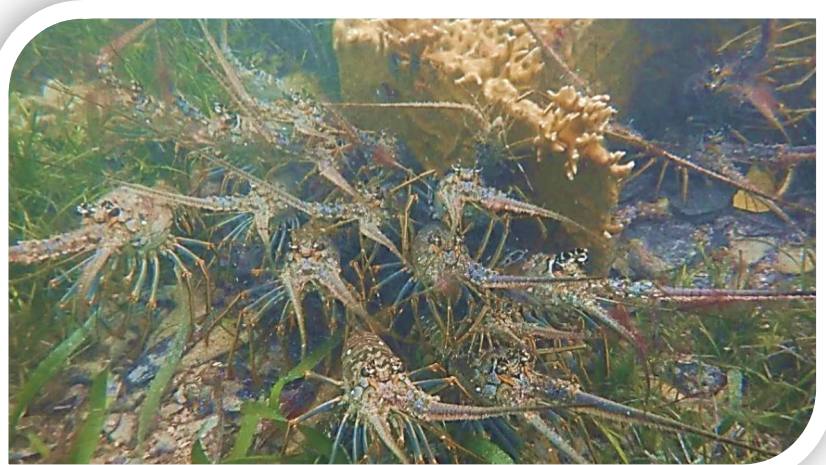
Spiny lobsters use many habitats within Biscayne Bay and offshore as they grow. Photographed by DERM biologists, while assessing coverage of seagrass and sponges throughout the bay.

From start to finish, 2022 was an important year for our community and Biscayne Bay. Last year marked year two since the onset of the COVID-19 pandemic, during which we were reminded of how resilient our community can be. We were also reminded of how important Biscayne Bay is to those who visit or call Miami-Dade County home. Whether it was finding solace in the outdoors with a walk along the Bay, going for a paddle, or assembling friends for a quick shoreline cleanup, Biscayne Bay provided an outlet.