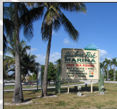
Beautiful Haulover Park

Come and join us for a fun weekend of old time bluegrass music in one of Florida's most beautiful settings.