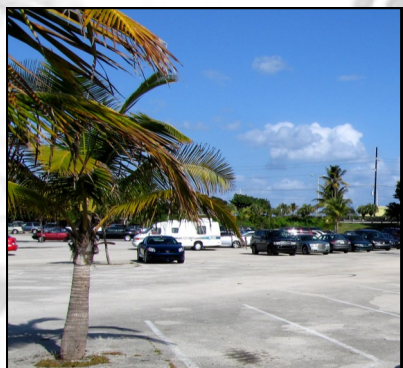
Lots of room for Camping