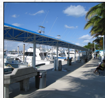
Charter Boats and Tours