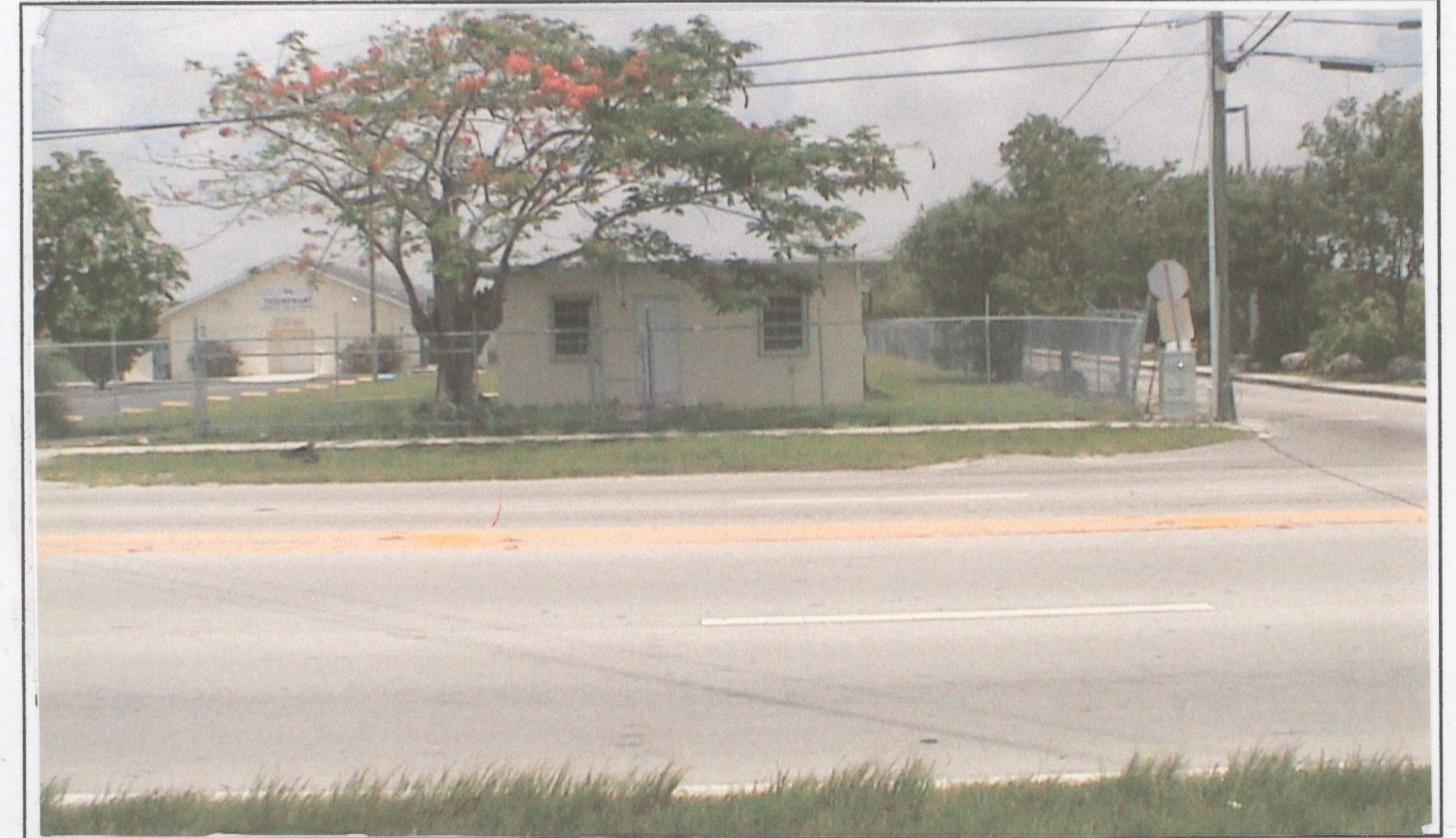
⑥ FRONT VIEW (EXISTING OFFICE BUILDING)