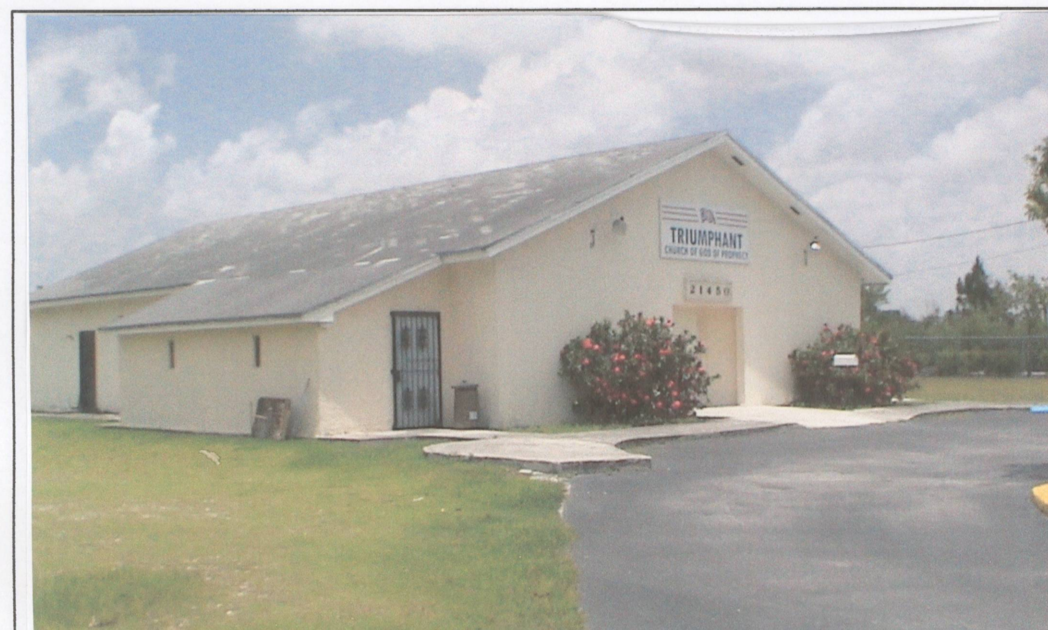
② SOUTH EAST VIEW

SEAL CARLOS J. MOURIN PROFESSIONAL ARCHITECT STATE OF FLORIDA LICENSE No. 7671 8280 SW 139th TERRACE VILLAGE OF PALMETTO BAY, FLORIDA 33158 PHONE: (305) 322-9097 FAX: (305) 255-1931