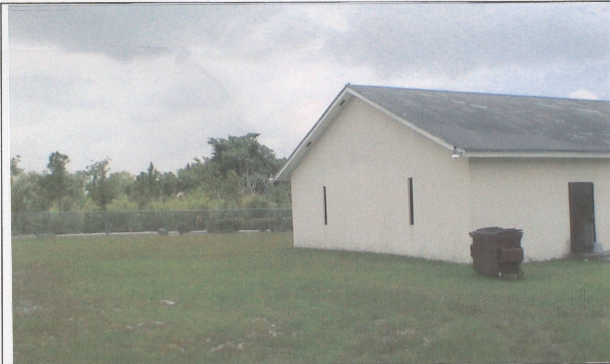
④ REAR VIEW (WEST)

RECEIVED BY CLERK Item # 07-15 CAB # 15 Exhibit # 4-1 JUN 26 2007 CLERK OF THE BOARD