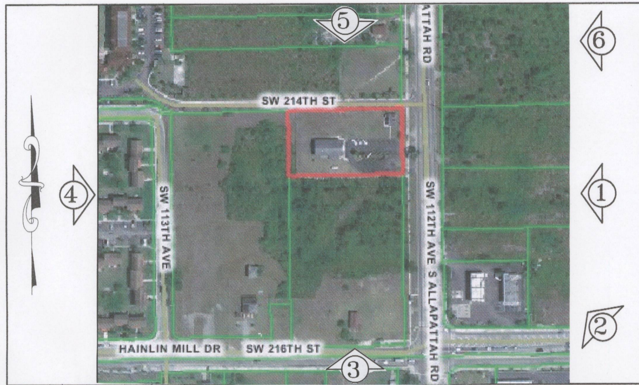
DIGITAL ORTHOPHOTOGRAPHY - 2006