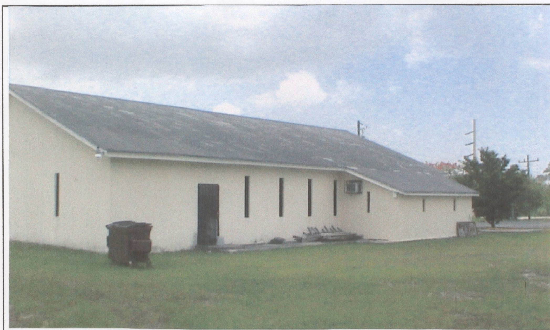
③ SOUTH VIEW