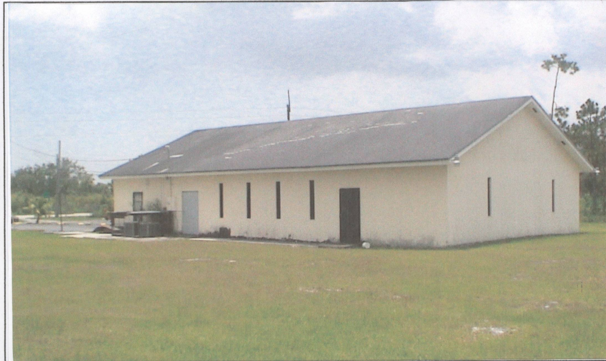
⑤ NORTH VIEW