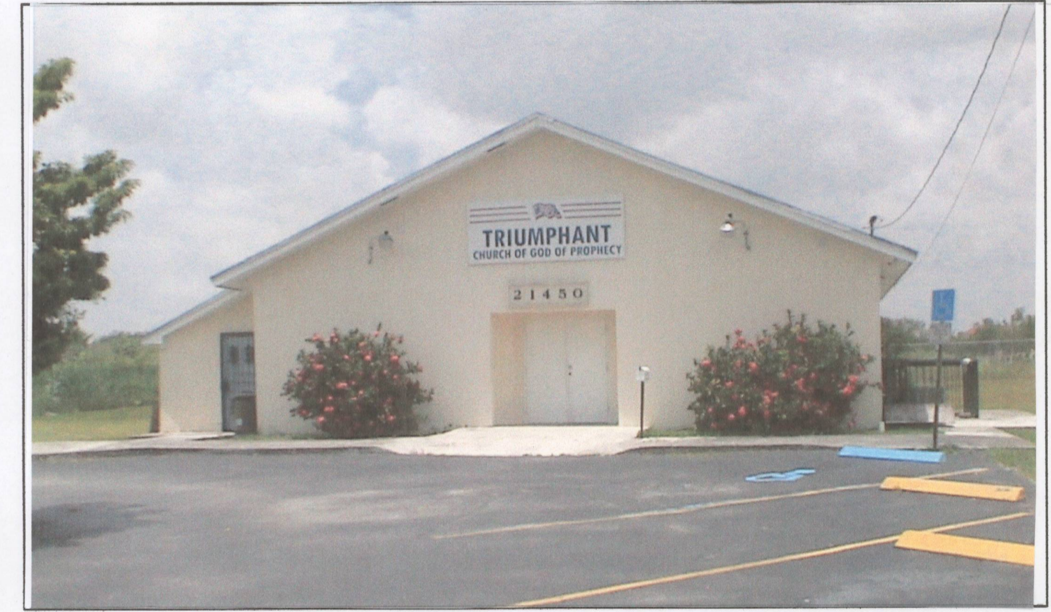
① FRONT VIEW (EAST)