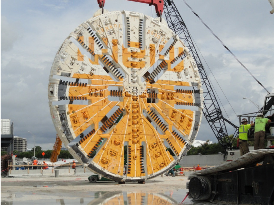
Figure6: Tunnel Boring Machine (TBM) cutter head.