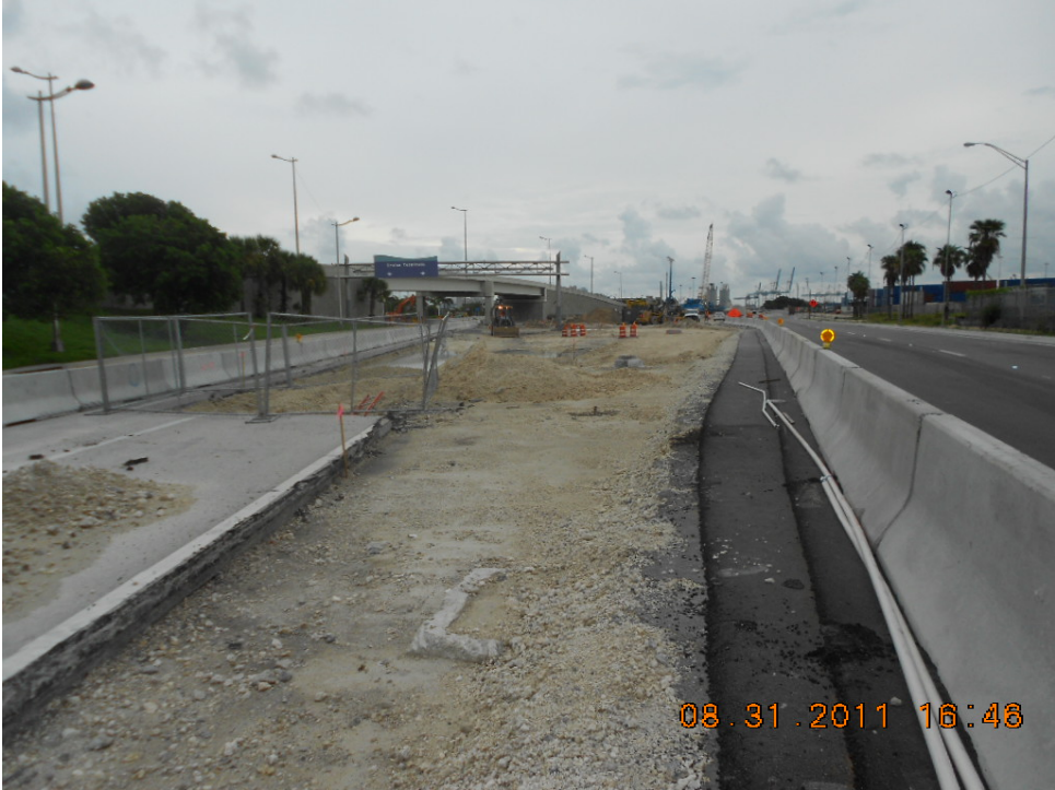
Figure 4: Dodge Island construction of new South Cruise Blvd.