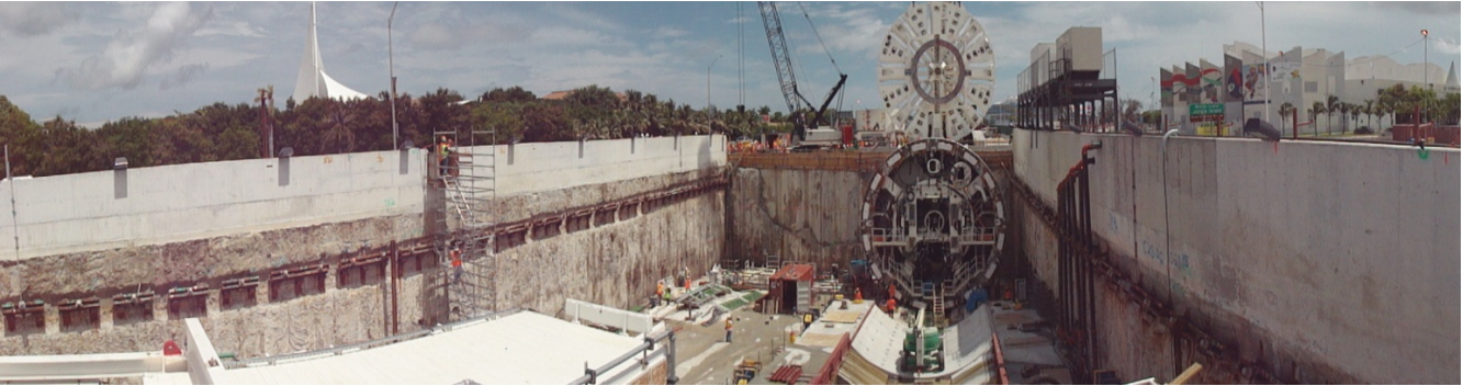
Figure 7: TBM Launching Pit