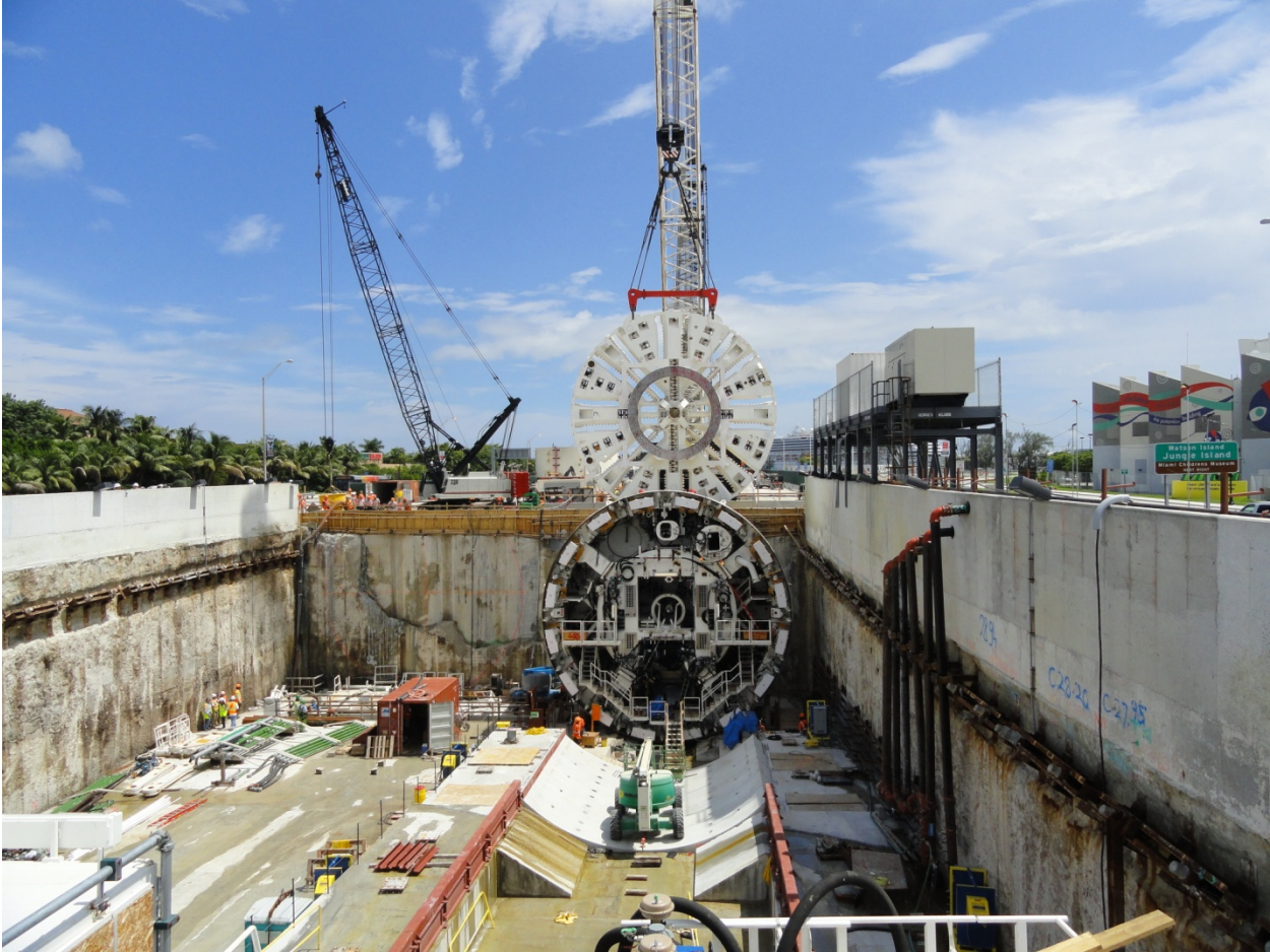
Figure 8: Lowering cutter head into launching pit.