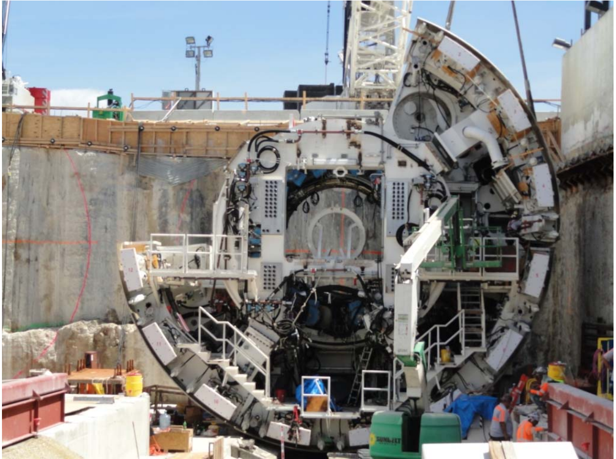
Figure 1: Construction of EPB shield assembly.