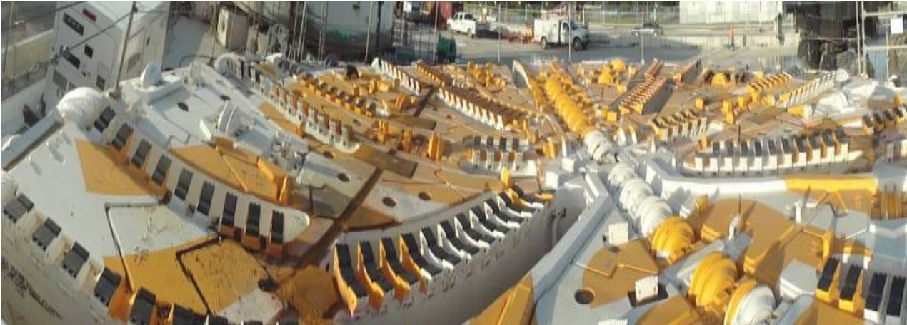
Figure 5: Completed cutterhead of the EPB shield.