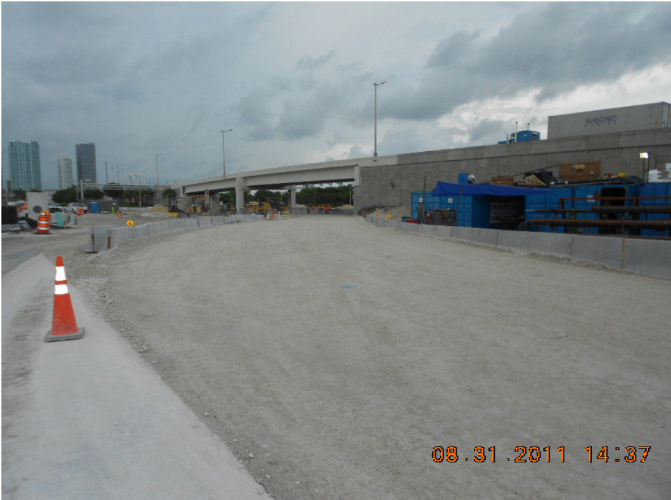
Figure 3: Dodge Island construction of temporary Westbound Port Blvd.