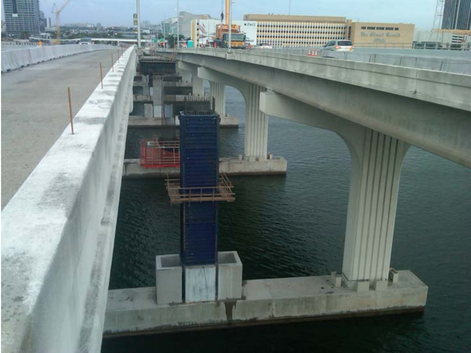
Figure 2: MacArthur Bridge construction of interior column.