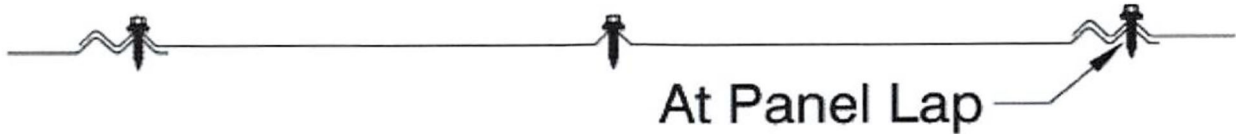
Panel Fastening Pattern