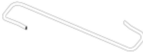
VEREA HURRICANE CLIP

NOTE: USE OF CLIP IS OPTIONAL. REFER TO MANUFACTURERS PUBLISHED INSTRUCTIONS FOR INSTALLATION DETAIL