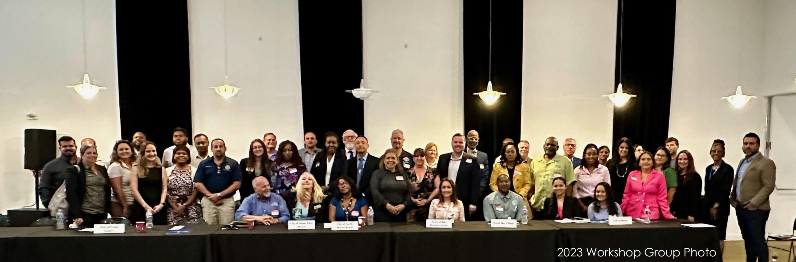
2023 Workshop Group Photo