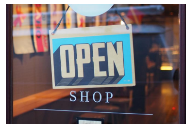
Small Business Enterprise Programs