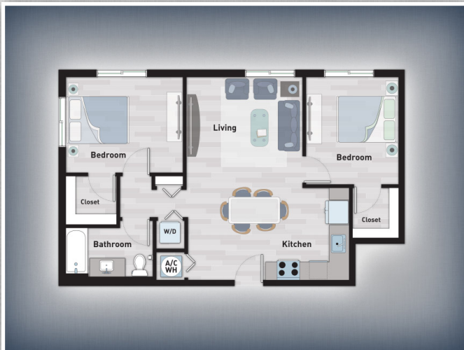
2 Bedroom B-2 874 Square Feet