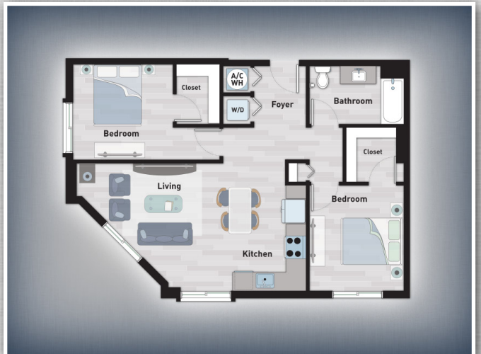
2 Bedroom B-3 910 Square Feet