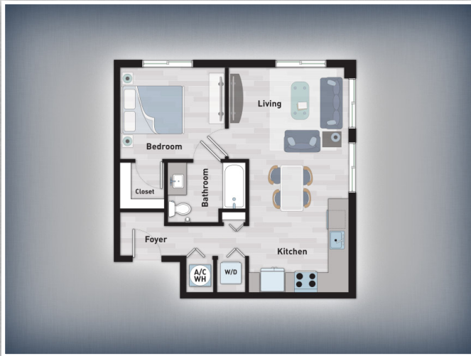
1 Bedroom A-2 644 Square Feet