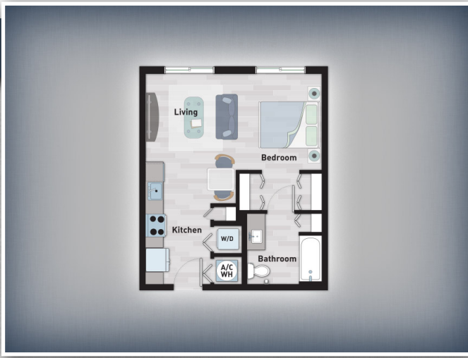
Studio ST-1 487 Square Feet