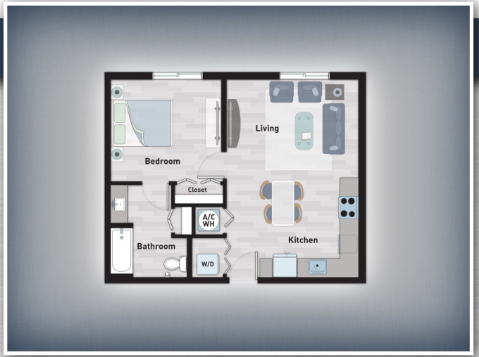
1 Bedroom A-1 643 Square Feet