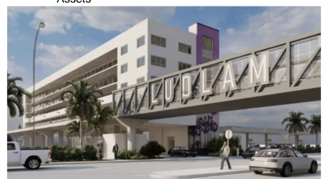
Disclaimer: ALL RENDERINGS/PICTURES SHOWN ARE FOR ILLUSTRATION PURPOSE ONLY