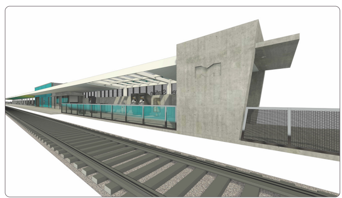
Rendering of NEC Station

The RFI was released to the public on November 18th and will remain open until January 6, 2025. An industry day, where potential vendors can ask questions, is scheduled for Monday, December 9th at 1:00 p.m. in the Aventura Library (2930 Aventura Blvd, Miami FL 33180). DTPW and BCT staff will review proposals and make next step recommendations by December.